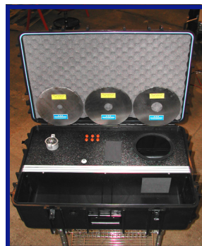
PORTABLE AIRFLOW CALIBRATION KIT includes 3 NIST traceable orifice plates and wheeled flight approved case